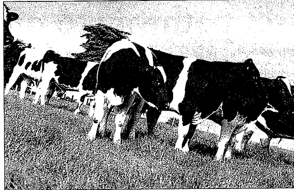
The well-marked Friesian calves were only 6kg heavier at slaughter than the poorly-marked Friesian or Jersey-cross calves.

Calf buyers who don't have scales can use a girth measure to assess calf weights. Muir says a girth measure of 78cm just behind the front legs equates to about a 40kg calf.