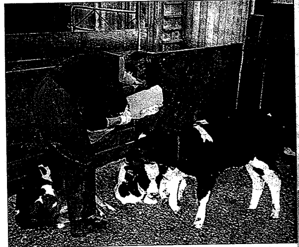
Early colostrum is crucial for healthy calf rearing. Tube feeding of colostrum is one way to ensure calves receive that vital early feed.